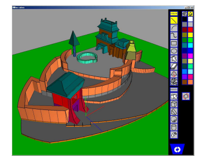
Figure 1. SESAME user interface, the palette on the right offers access to all operations of the system.

The user interface of SESAME is based on drawing familiar 2D shapes in a perspective view onto 3D surfaces and then extruding any closed contour in the 2D drawing to create many familiar 3D Furthermore, shapes. users can sculpt objects by drawing on their surface and then extruding "into" an